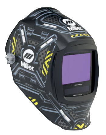
Black Ops™ 280047