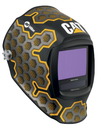
Cat® 2nd Edition 282007