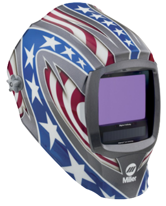
Stars and Stripes™ 280049