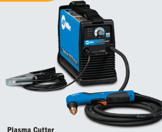
Plasma Cutter 907529