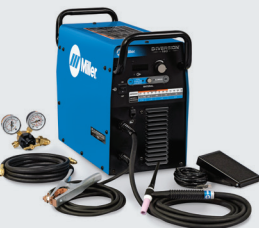
TIG Welder 907627