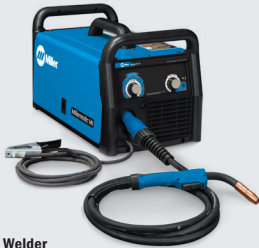
MIG Welder 907612