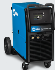
TIG/Stick Welder 907596 (without spool gun)