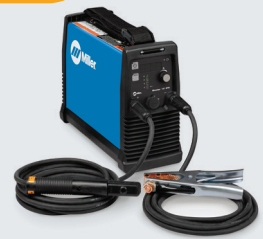
TIG/Stick Welder 907710