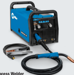
Multiprocess Welder 907693