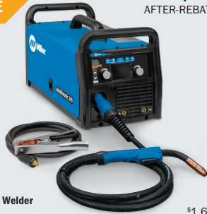
Multiprocess Welder 907693