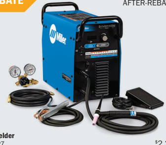
TIG Welder 907627