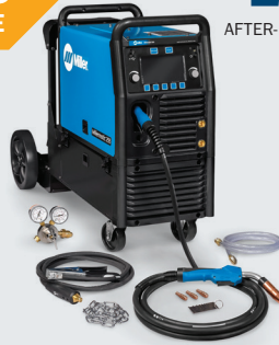
MIG Welder 951766