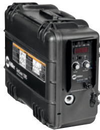
SuitCase® 12RC Wire Feeder 951580

Lightweight, voltage-sensing wire feeders include secondary contactor, gas valve, drive roll kit and gun. See literature M/6.42.