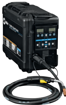
FieldPro™ Smart Feeder 300935 For use with Big Blue 350 PipePro SF model only. See page 2 for more information.

Lightweight and flexible enough to run a variety of wires up to .062-inch diameter. Includes remote voltage control, drive roll kit and Bernard™ BTB Gun 300 A. See literature M/6.5.