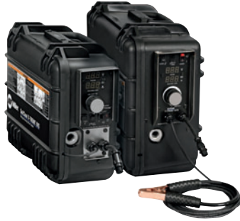
SuitCase® X-TREME™ 8VS Wire Feeder 951583 With Bernard™ BTB Gun 300 A