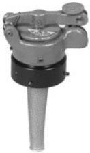
FA-1D Lockable Flame Arrestor Fuel Cap 043947 Field Fuel cap can be padlocked to prevent vandalism. A built-in flame arrestor prevents flames or sparks from entering the fuel tank.

Spark Arrestor (Muffler) Kit 300585 Field Prevents particles from leaving the muffler that could potentially start a fire. Mandatory when operating on California grasslands, brush, or forest-covered land, and all national forests. For other areas, check your state and local laws. Meets U.S. Forest Service Standard 5100-1B.