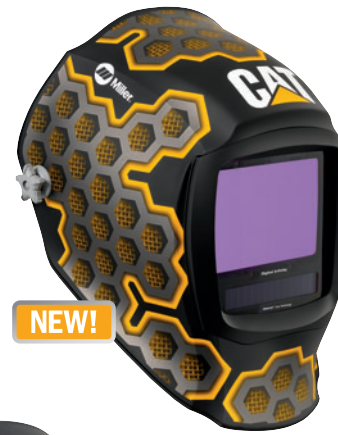
CAT® 2nd Edition 282007