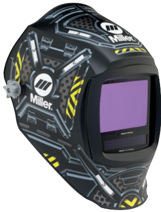
Black Ops™ 280047