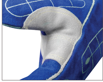
Wide reinforcement strip over palm and around thumb