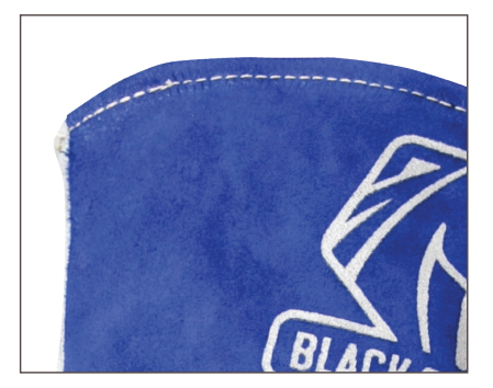
Kevlar® stitching provides protection against sparks, with better abrasion resistance