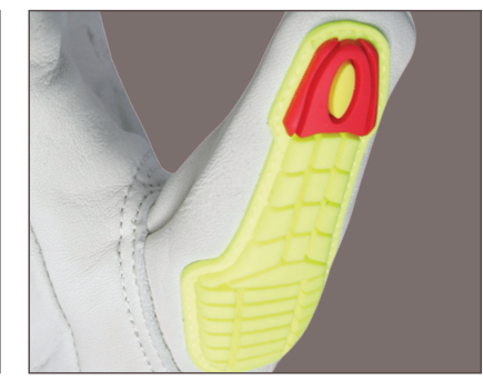
Ergonomic keystone thumb maximizes flexibility