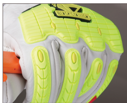
TPR flex points provide flexibility & enhanced dexterity