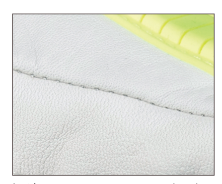
Inside seam construction protects threads