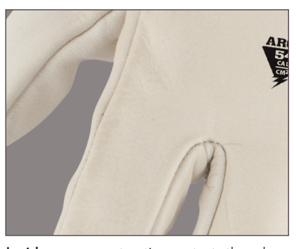
Inside seam construction protects threads