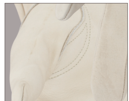
Ergonomic keystone thumb maximizes flexibility