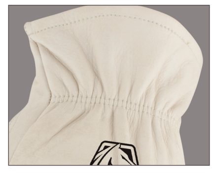
Shirred elastic cuff offers a snug fit