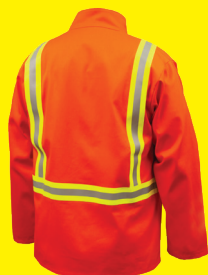
JF1010-OR Safety Orange