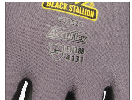
Tested to EN388 4131 — level 4 Abrasion resistance; level 3 Tear resistance