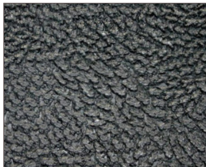
Nitrile Micro-Foam Palm offers excellent resistance to oil, grease, & solvents