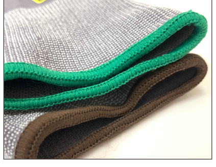
Color-Coded Binding for quick & easy size identification