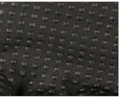
Micro-Dot Palm System offers excellent oily, wet, & dry grip