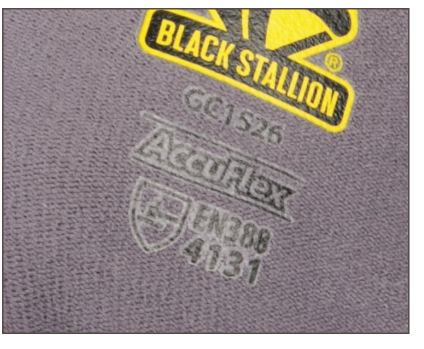
Tested to EN388 4131 – level 4 Abrasion resistance; level 3 Tear resistance