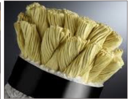
High ANSI A7 cut protection from para-aramid poly steel palm liner