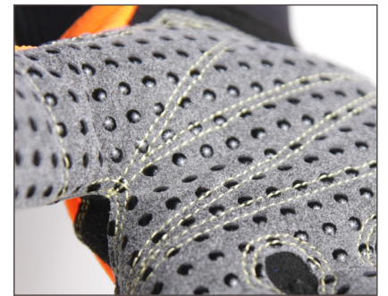
PVC Dot System on palm improves grip