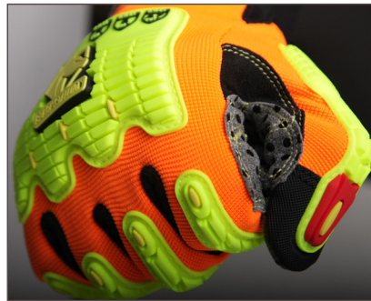
TPR Pads protect back of hand and fingers