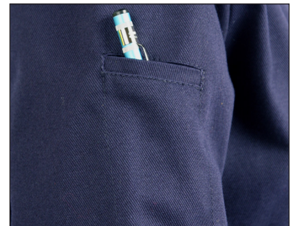
Scribe Pockets on Both Sleeves hold markers, pens, etc.