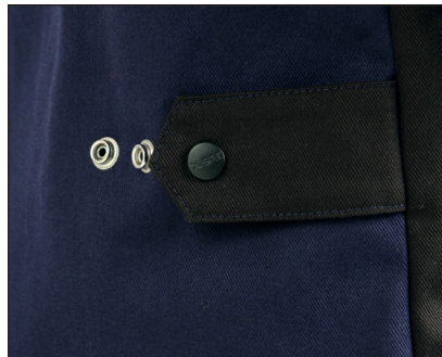
3-Notch Waist Adjustment helps create the perfect fit