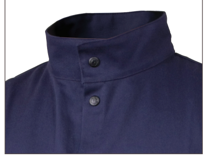
Stand-Up Welder's Collar for better neck protection