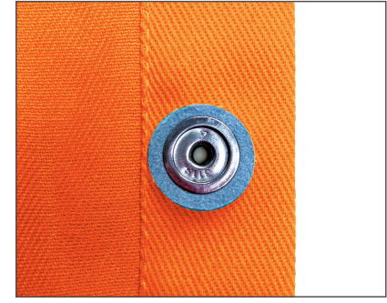
Leather Backing on all front snaps offers durable reinforcement