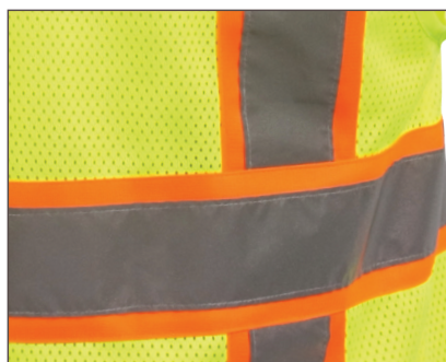
2" Reflective Tape with contrasting poly border