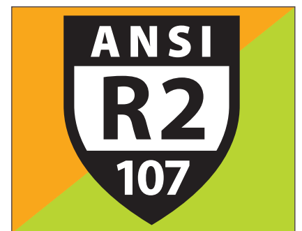
ANSI/ISEA 107-2015 Type R, Class 2 high visibility protection