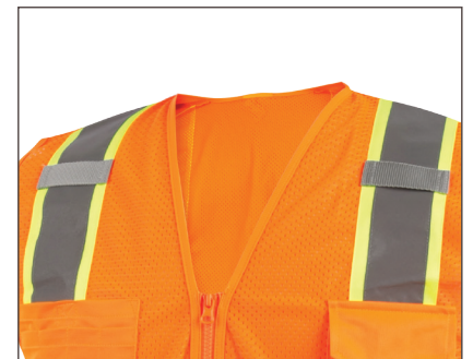
Dual Mic Tabs allow for mic placement on either shoulder