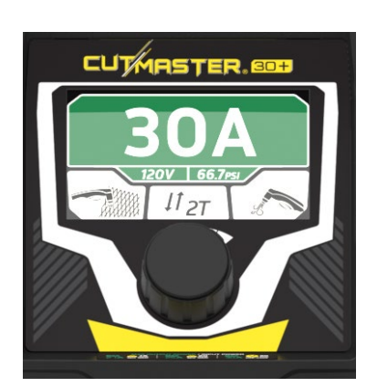
Simple and intuitive TFT LCD panel

Cutmaster 30+ is the perfect combination of power and portability for hand-held plasma cutting machine. Plus means more, so we've added a user-friendly 4.3 in. TFT LCD screen and upgraded features that give you even more control and flexibility to master any cut up to 10 mm (3/8 in.). Together with the SL60 1Torch, it all adds up to the total plasma cutting package.