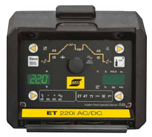
ET 220i AC/DC HF TIG inverter power source control panel