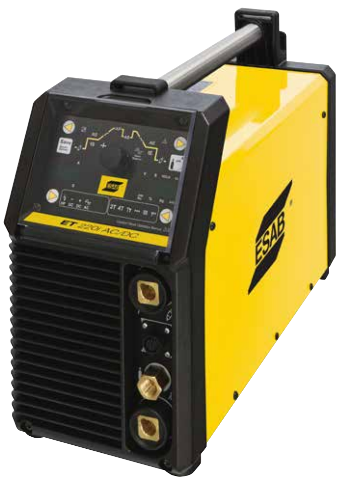
ET 220i AC/DC Part No: W1009300