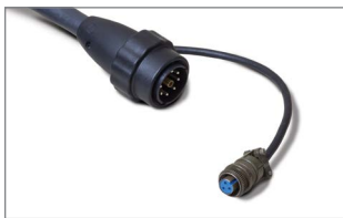
Mechanized torch lead with quick disconnect.