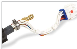
Easy Torch Removal (ETR) connection - makes Duramax retrofit torches easy plug-and-play upgrades

For more information, visit: www.hypertherm.com