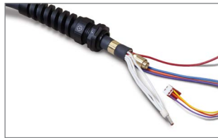
Handheld or mechanized torch lead without quick disconnect for Powermax600 CE systems.