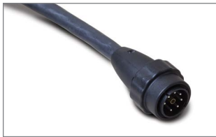
Handheld torch lead with quick disconnect.