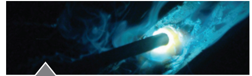
View with Jackson Safety* ADF Helmet with Balder* Technology