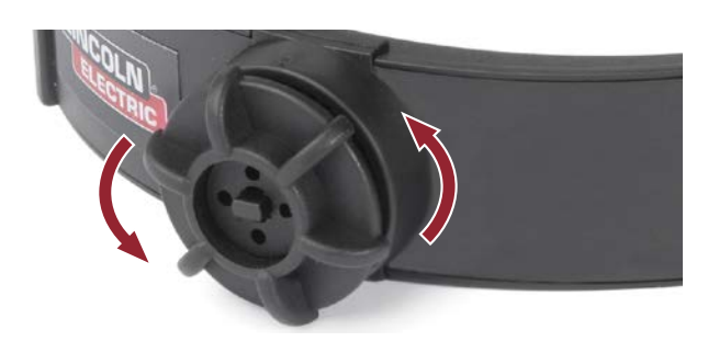
Ratchet adjustable tightness mechanism and adjustable top headband for ideal fit and balance