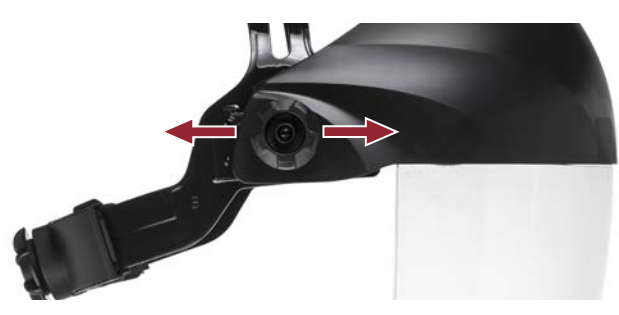
Slide forward / backward adjustments for optimal face to lens distance