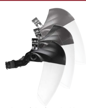
The rotation plane of the face shield can be adjusted for personalized protection and comfort.