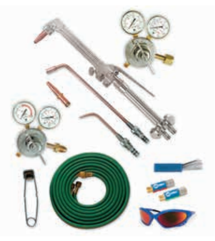
HBA-40510 / HBA-40300 with heavy-duty regulators