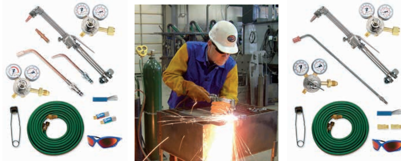
MBA-30510 / MBA-30300