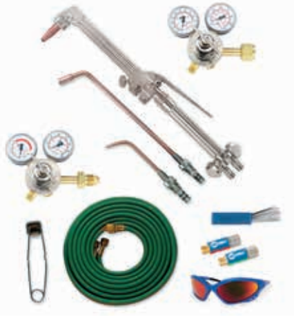
HBA-30510 / HBA-30300 with medium-duty regulators