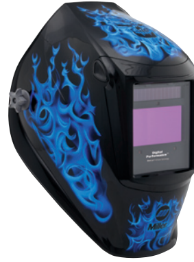
Blue Rage™ 289802