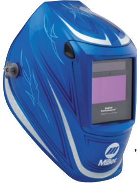
'64 Custom™ 289807