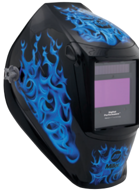
Blue Rage™ 289802