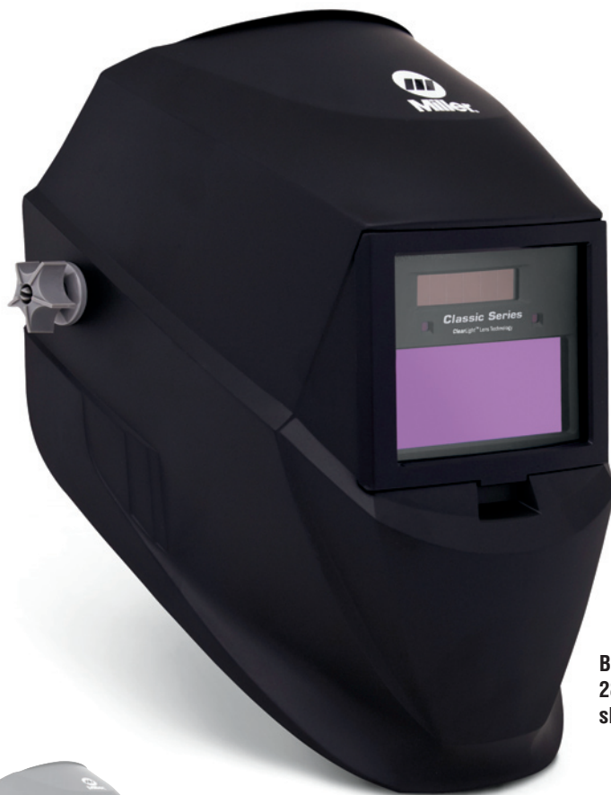
Black (VS) 287803 shown.