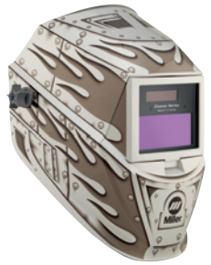
Metalworks™ (VS) 287810