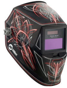
Rise™ (VS) 287815