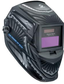
Metal Matrix™ (VS) 288519