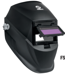
FS#10 Flip-Up 287798