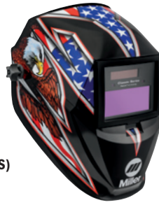
Liberty™ (VS) 287820