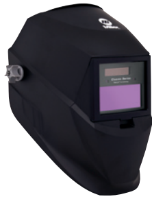
Black (VS) 287803