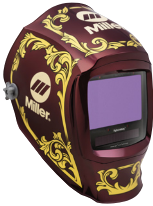
NEW! Imperial™ 280053