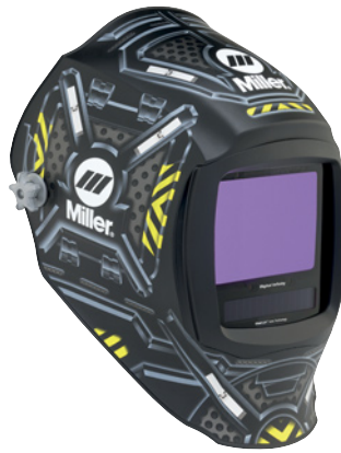
Black Ops™ 280047