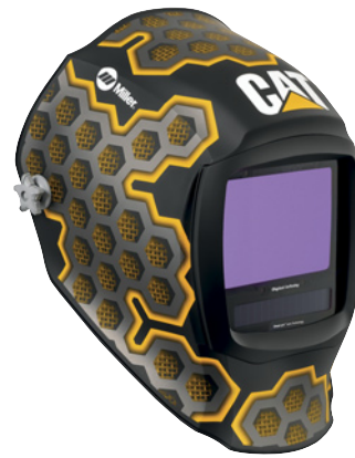
Cat® 2nd Edition 282007