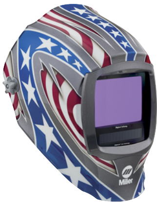
Stars and Stripes™ 280049

©2019 Caterpillar. CAT, CATERPILLAR, BUILT FOR IT and their design marks are registered trademarks of Caterpillar, Miller Electric Mfg. Co. is a licensee of Caterpillar Inc.