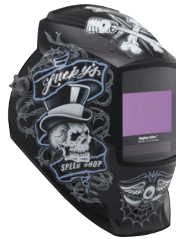
Lucky's Speed Shop™ 296766