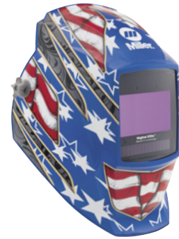
Stars and Stripes™ III 296770