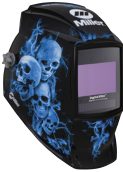
Blue Rage™ II 296774