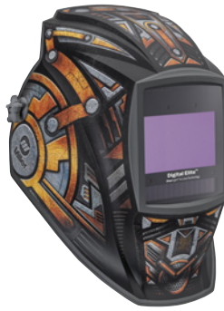
Gear Box™ 296771