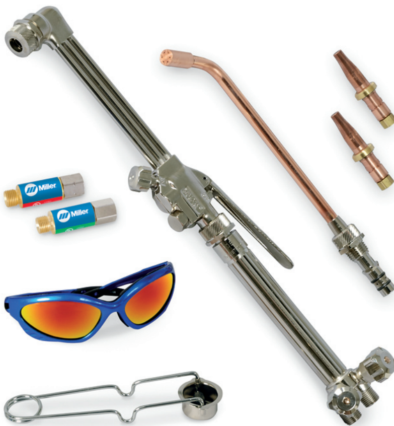
Toughcut Select acetylene combo pack shown.

Performance and safety meet for an efficient way to upgrade your oxy-fuel system.