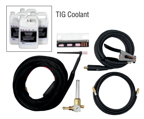
W-250 (WP-20) Torch Kit for Syncrowave 250 DX TIGRunner