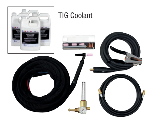
W-375 Torch Kit for Syncrowave 350 LX TIGRunner