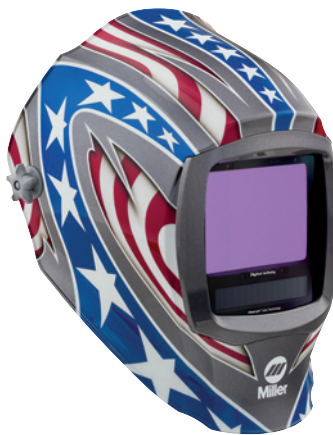
Stars and Stripes™ 280049