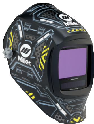
Black Ops™ 280047