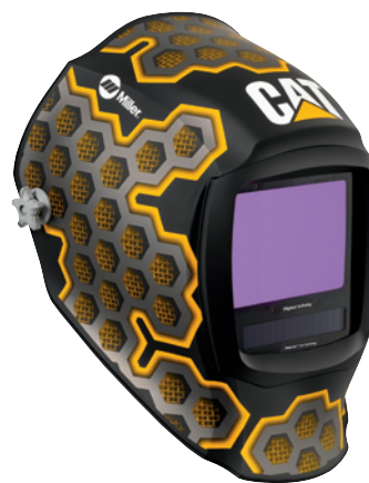
CAT® 2nd Edition 282007