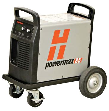
Wheel/gantry kits Complete, pre-assembled kits for added mobility.

229370 Powermax65/85 wheel kit 229569 Powermax65/85 gantry kit