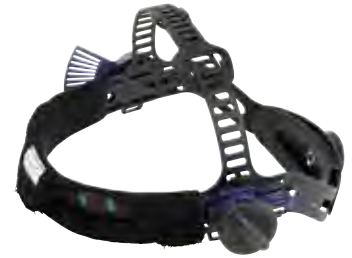
New headband with smooth ratchet for precise tightening.

Additionally, these helmets' affordable price and ease of use ensures that their superior quality and expressive style are accessible to even the most occasional welders.