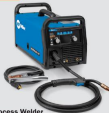
Multiprocess Welder 907693