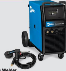
TIG Welder 951616