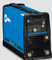
TIG Welder 907685