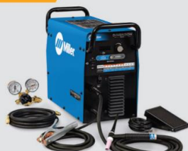
TIG Welder 907627