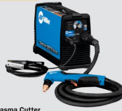
Plasma Cutter 907579