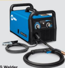
MIG Welder 907614