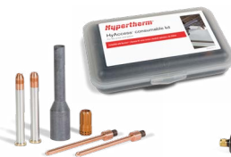
HyAccess™ consumable kits