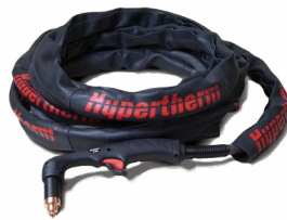
Leather torch sheathing