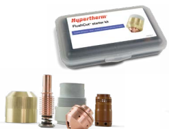
FlushCut™ consumable kits