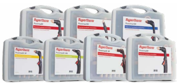
Essential consumable kits

Examples of qualifying accessories and consumable kits are shown below