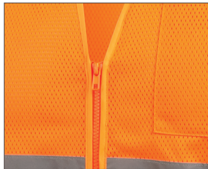
Zipper Closure for a more secure fit