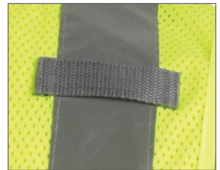
Mic Tab allows for quick & easy access to hand microphone